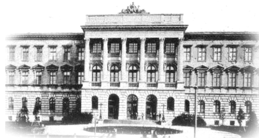
Lviv Polytechnic National University Main Building

Lviv Polytechnic National University Students' and PhD Students' Union and Self-government Young Scientists' Council